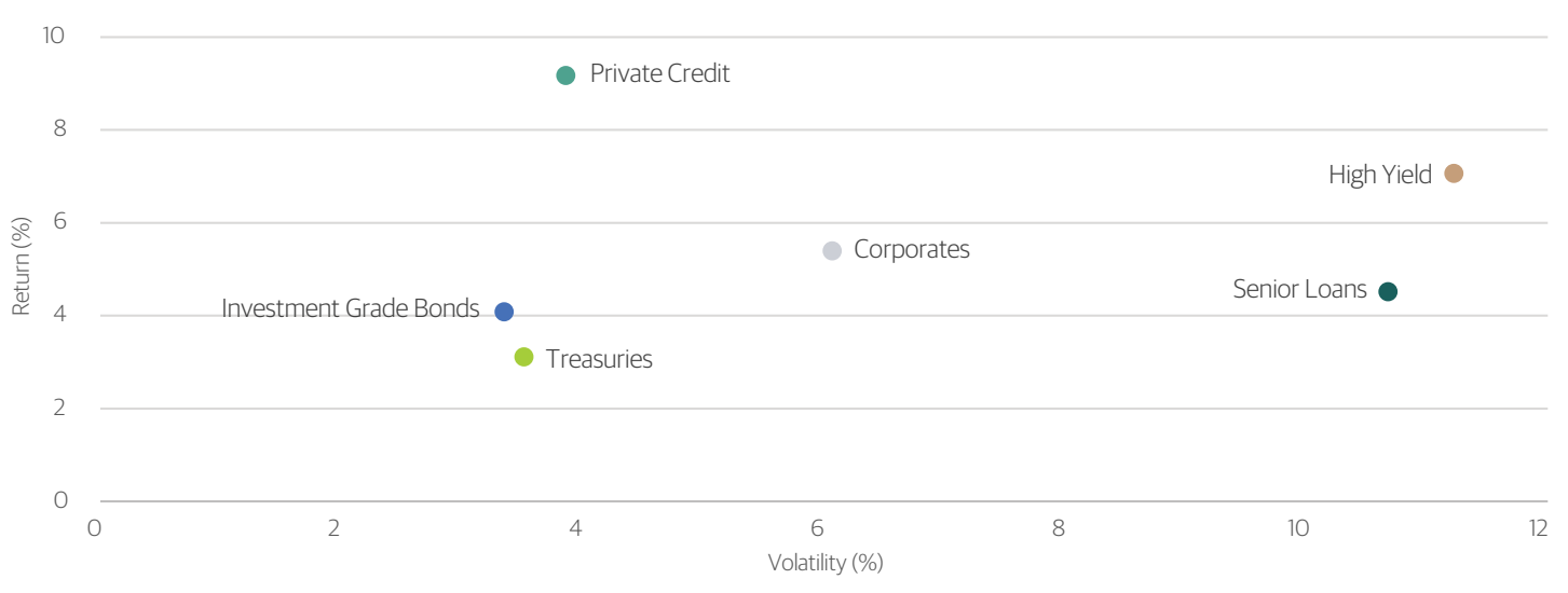
EXHIBIT 1: Comparing Risk and Return across Select Asset Classes (15 Years Annualized)

Volatility is measured using standard deviation. Morningstar computes standard deviation using trailing quarterly total returns for 15 years. All of the monthly standard deviations are then annualized and the volatility is expressed as a percentage.