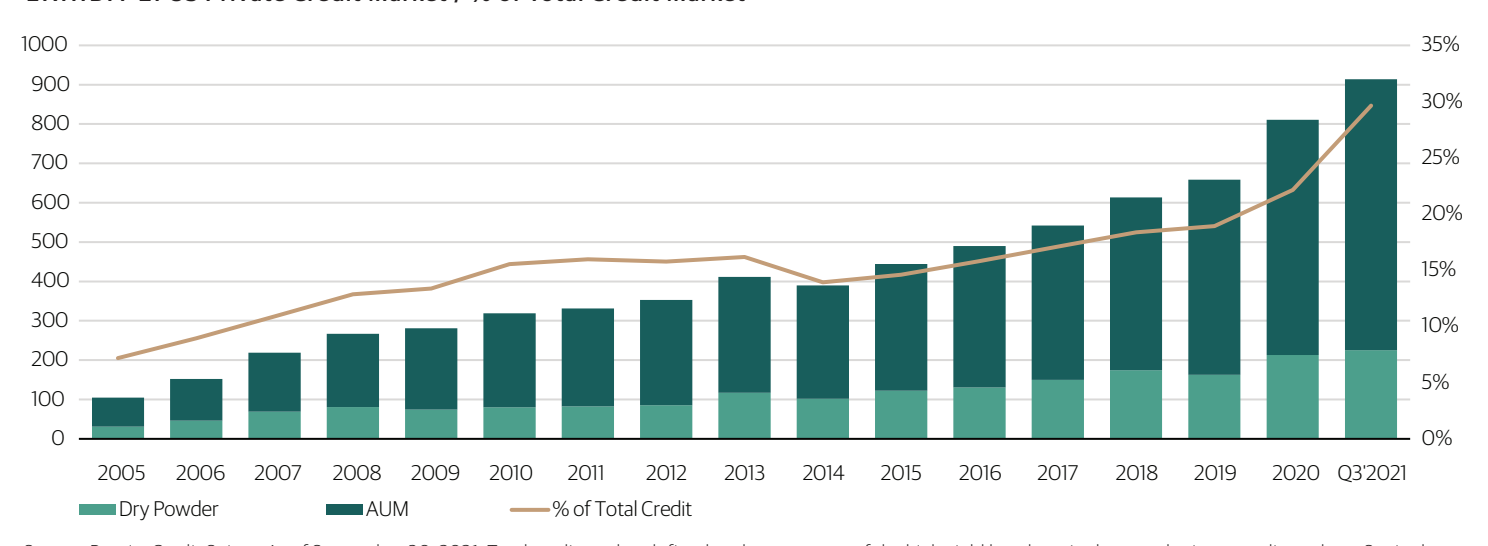
EXHIBIT 2: US Private Credit Market / % of Total Credit Market

Source: Preqin, Credit Suisse, As of September 30, 2021; Total credit market defined as the aggregate of the high yield bond, senior loan, and private credit markets. Senior loans refers to broadly syndicated loans.